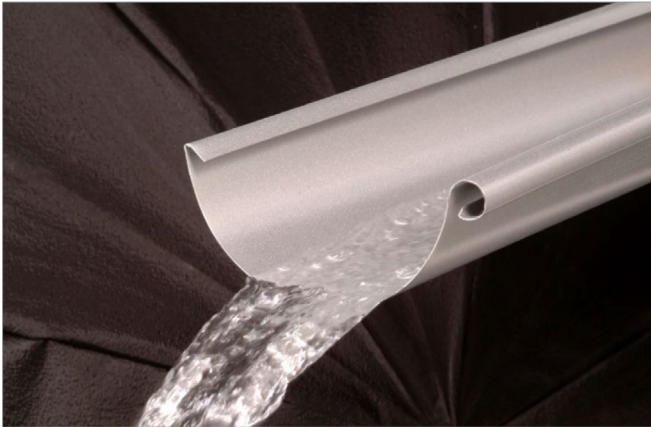
Selecting the correct rainfall intensity is essential

Selecting the correct rainfall intensity is crucial to carrying out an effective and safe design for the roof drainage components on a building. After blockage by debris, poorly selected rainfall intensity is the leading cause of water ingress into buildings from gutter systems. Unless the design process is understood, the design can be significantly under what is required and can result in regular flooding; or the design can be significantly over what is required, and excessive materials used and/or a siltation risk can be generated. Therefore, rainfall intensity design is the critical first step in any roof drainage design.