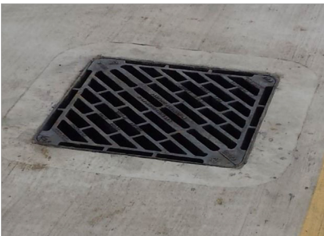
Vented manhole lid for siphonic system

It is vital that any vented lids meet the requirements of BS 8490:2007, with an open area of at least 2 x the incoming pipe area. To achieve this, 'vented lids' with little holes drilled in them are not adequate; full open grate covers, usually used as large highway gully tops, must be used.