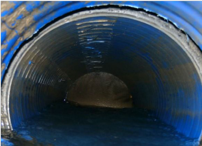
Poor detailing in SuDS tank (geotextile not trimmed away at pipe entry) limiting flow

However, it is not just siphonic systems which need careful detailing; although less severe problems can occur on gravity systems too. External downpipes should be discharged into gullies, and back inlet gullies with open grates should be fitted to pipes serving internal downpipes.