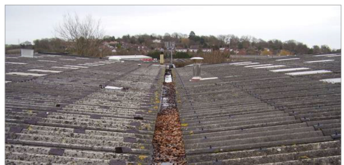
Even good designs will fail if not maintained