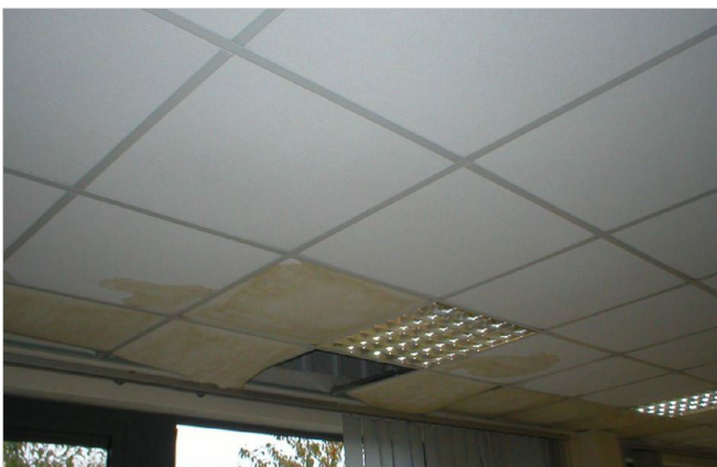
Damage caused by inadequate roof drainage

Rainfall is presented on meteorological maps which show the intensity of rainfall likely to fall in a two-minute storm for a given return period. This is a very short duration event, and will typically occur in early and late summer, usually on a warm day. The highest level of rainfall is in areas usually associated with dry weather; and so east Anglia and the south east of England have a design rainfall level over twice that of some parts of Scotland. For example, the normal criteria for external eaves gutters is a one-year event which would vary from 0.022 l/(s.m 2 ) in London to 0.01 l/(s.m 2 ) in Fort William.