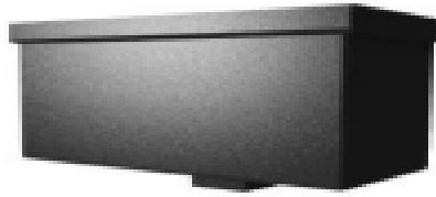
Image show a hopper which is fixed to the wall with 8x80mm wall plugs

Below are images of the products used by Alu-Cast on the Dzogchen Beara Centre.