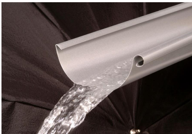
Selecting the correct rainfall intensity is essential

Selecting the correct rainfall intensity is crucial to carrying out an effective and safe design for the roof drainage components on a building. After blockage by debris, poorly selected rainfall intensity is the leading cause of water ingress into buildings from gutter systems. Unless the design process is understood, the design can be significantly under what is required and can result in regular flooding; or the design can be significantly over what is required, and excessive materials used and/or a siltation risk can be generated. Therefore, rainfall intensity design is the critical first step in any roof drainage design.