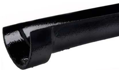
Deep Half Round profile gutter