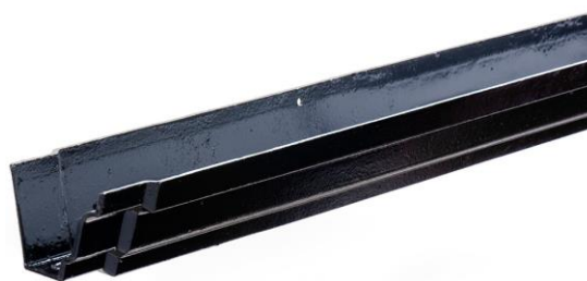
G46 Moulded gutter