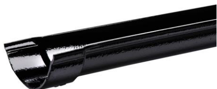
Beaded Half Round profile standard gutter