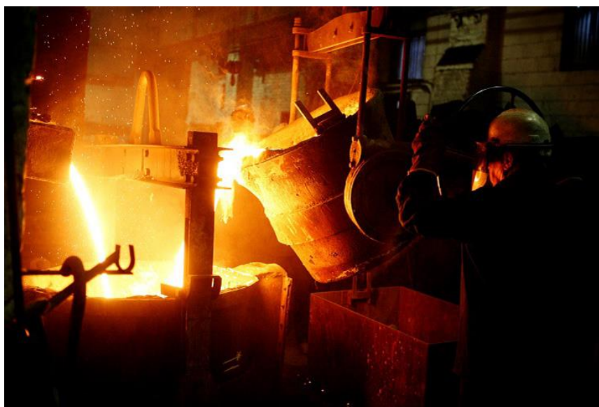
An example of the cast iron process

The original process for casting in iron was floor moulding using sand bonded with clay – commonly known as 'green sand'. A pattern would be made from wood to mirror the required shape or profile, which was used to form the male and female sand moulds. Molten iron was then poured into the mould where it cooled over time until it had solidified.