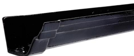
Notts OG standard gutter