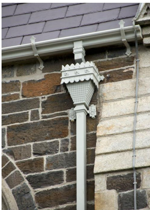
An example of a holderbat

Traditionally, cast iron rainwater pipes were jointed with joint sockets cast on to the end of the pipe, either with cast on fixing ears/lugs or without, for fixing with independent brackets/holderbats. Nowadays, some pipe systems are offered with loose pipe sockets which have a spigot at the base that can be just placed inside a plain end of the pipe.