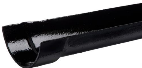
Plain Half Round profile gutter