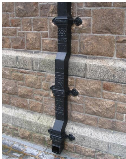
A cast iron drainpipe at Guernsey Market, St Peter Port, Guernsey

Often cast iron rainwater pipes to external elevations of a building utilise BS416 grade traditional pipe system, generally used for soil and vent pipes, known in the trade as LCC. This can be for various reasons, either because the rainwater pipe is connected to a combined rainwater and foul waste sewer, or that visually it needs to match adjacent cast iron soil and vent pipes. If cast iron pipes are specified for internal use, modern cast iron systems with rubber sealed bolted compression joints conforming to BS EN 877 should be used.