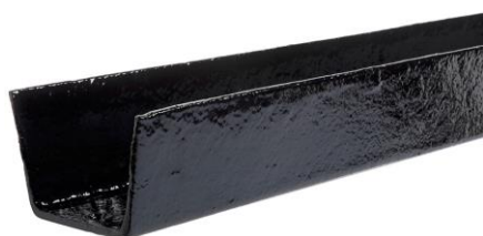
box profile gutter