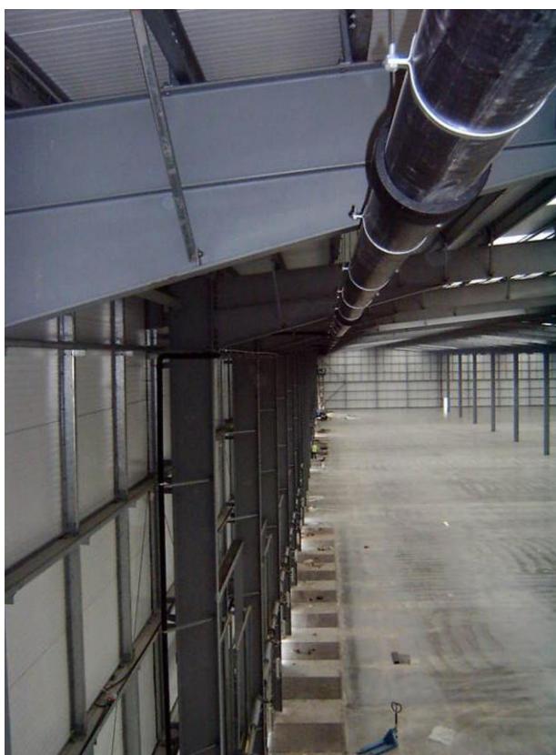
Siphonic pipework horizontal at high level

Siphonic roof drainage is not a new concept. It was originally developed by the Finnish engineer Ovlai Ebling in the late 1960s and the first commercial installation was in a Swedish turbine factory in 1972. Since its inception, siphonic roof drainage systems have been fitted throughout the world, with the UK market having a number of manufacturers.