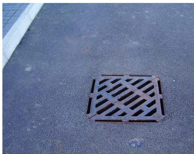
Vented lid on discharge manhole

All siphonic roof drainage systems work in exactly the same way. Air is excluded by a baffle plate over the outlet hole, which causes the pipes to run full of water. When the pipes are full of water the height difference between the gutter and the discharge point creates negative pressures in the pipe system, which draws water through the system. The greater the drop, the greater the potential energy available, and the greater the overall flow capacity of the outlet. However, if negative pressure becomes too large, cavitation and pipe implosion are risk factors, and so designs must be carried out by a competent person using suitable software.