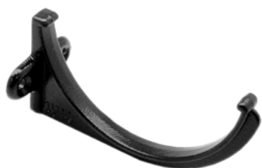
Standard fascia bracket

Modern style proprietary gutter systems tend to be fixed with concealed gutter brackets giving the gutter a sleek minimalistic appearance or even direct fixed through the vertical rear of the gutter eliminating the brackets altogether.