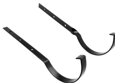
Rafter arm brackets