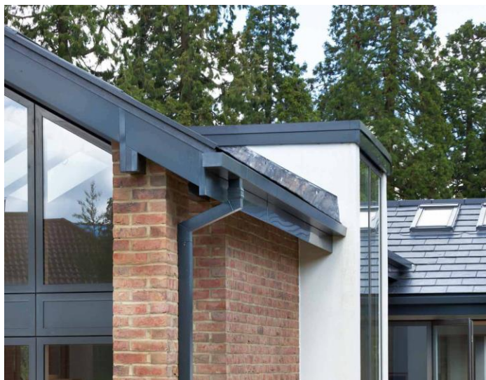
Box gutter and 72x72mm downpipe in RAL 7021 granite grey