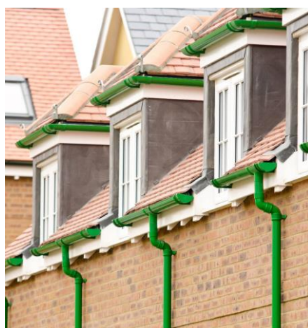
Half round gutter and 63mm Ø downpipe

Install gutters level, or to a fall of 1:600. Check levels using a water level (a long transparent flexible tube filled with water) or other appropriate device. Set gutter height to prevent possible overshoot, in particular with narrow gutters draining high steep sloping roofs. Gutters installed too high may be damaged by high velocity impact of sliding snow. In areas of heavy snowfall snowboards should be considered, especially above pedestrian areas.