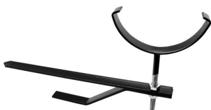
Rise and fall bracket