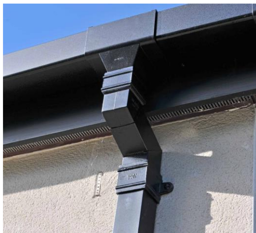
Box gutter and 72x72mm downpipe in textured black finish

On-site hand painting: Hand painting with conventional liquid paints directly to bare aluminium surfaces is not recommended, is time-consuming and therefore expensive and will not give the durability and colour fastness of architectural grade powder coating.