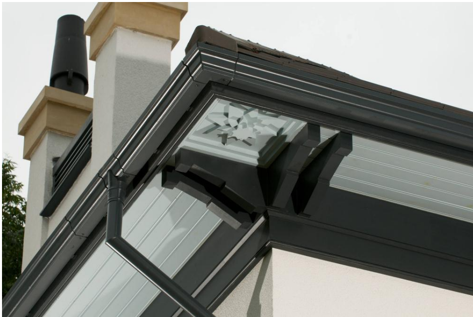
Traditional Moulded Ogee gutter system installed at the BRE Innovation Park, Watford.

This standard covers traditional cast and extruded aluminium gutters and fittings, together with extruded aluminium rainwater pipes with cast aluminium sockets and fittings. The standard will ensure that the integrity and quality of the UK's traditional gutter styles are protected for use on the refurbishment of the country's historic buildings as well as for use on retro-style new buildings in keeping with British architectural heritage.